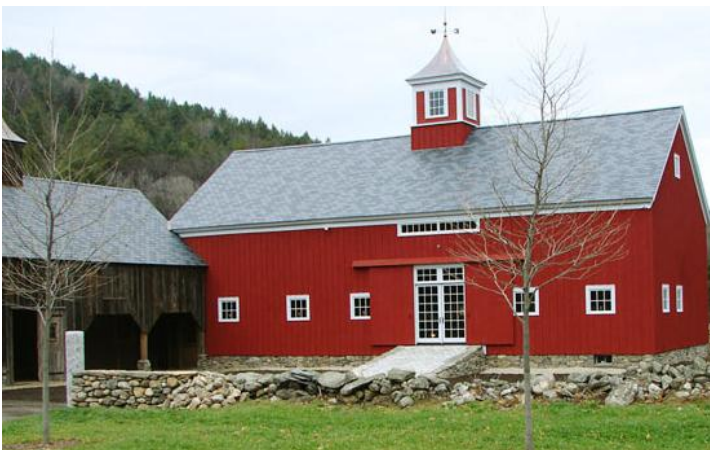
Riverledge Farm, 2060 Townshend Road, Grafton, VT 05146