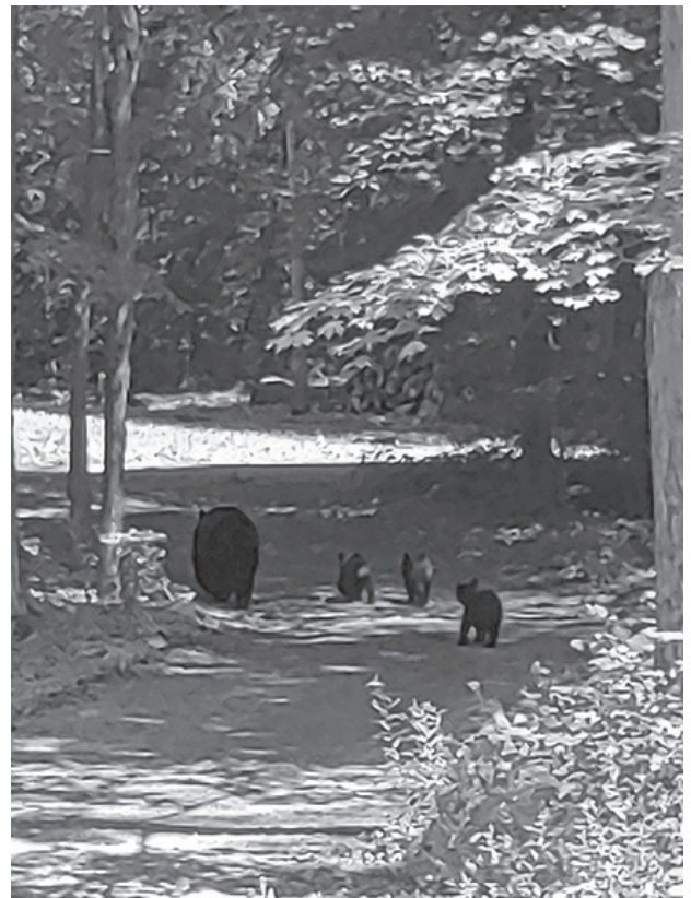
Sow with cubs in Waltham, VT