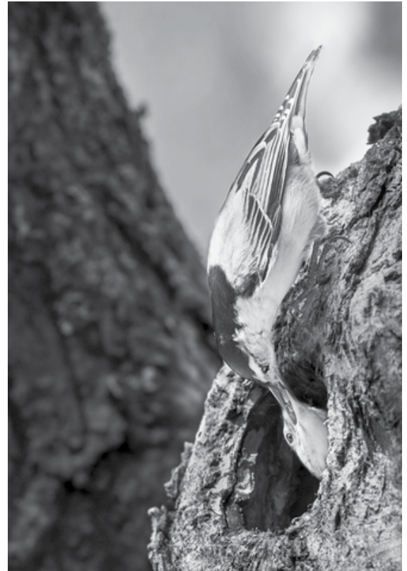
Nuthatch photo by Tig Tillinghast (2007s)